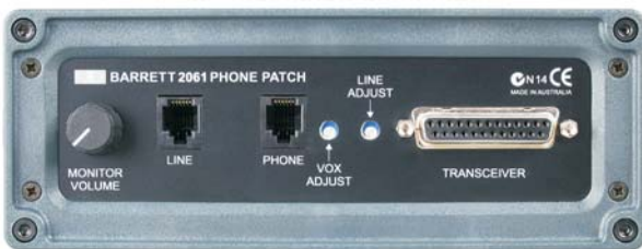
Barrett 2061 Phone Patch rear panel