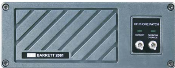
Barrett 2061 Phone Patch front panel